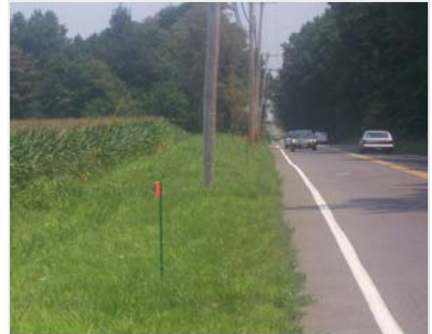
Crossing Guards in test along Saylor's Pond Rd NJ

Military bases are always huge sources of wildlife because they are off limits to hunters, and Ft Dix is no exception. The township recorded 35 carcasses and 80 accidents from deer last year on that and several other township roads, with Saylor's Pond Rd being one of the worst for deer collisions.